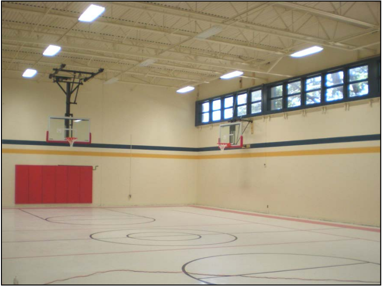
View of renovated Gymnasium