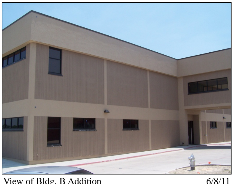
View of Bldg. B Addition