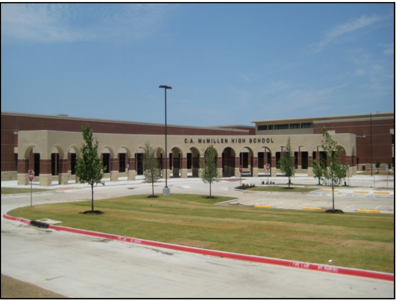
View of new Main Entry