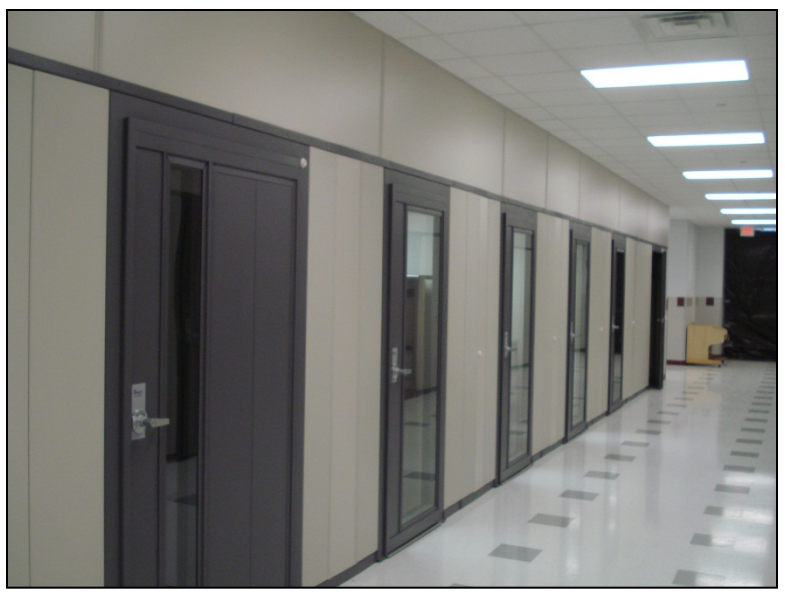
Interior view of Fine Arts Addition