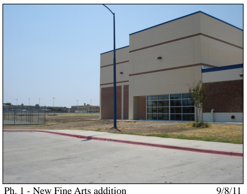
Ph. 1 - New Fine Arts addition