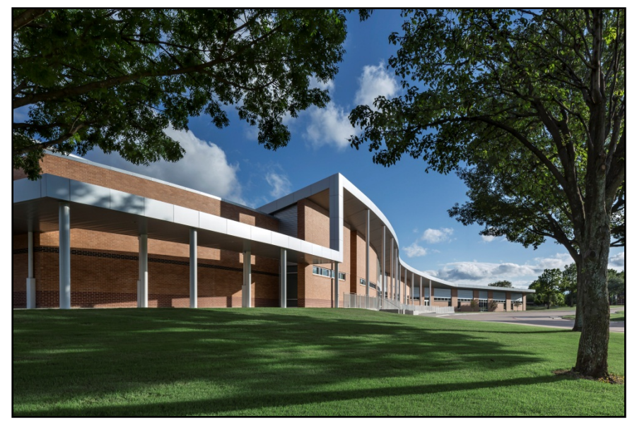
View of new Main Entry Pictures courtesy of Charles Davis Smith Photography