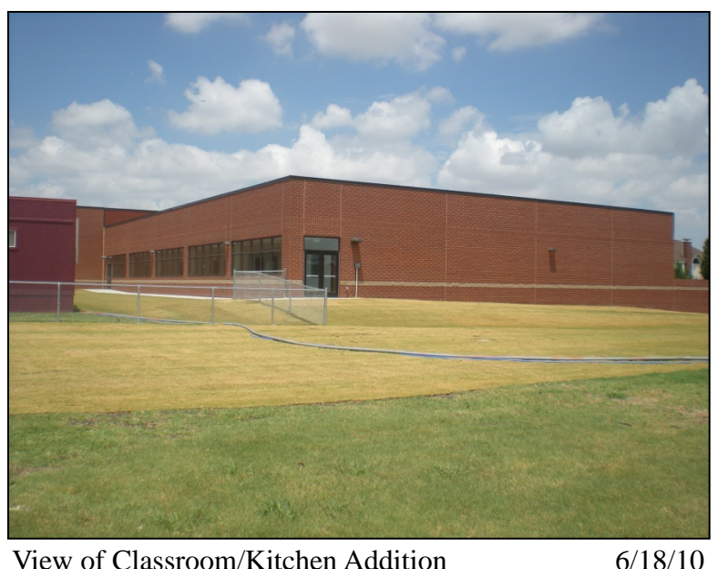
View of Classroom/Kitchen Addition