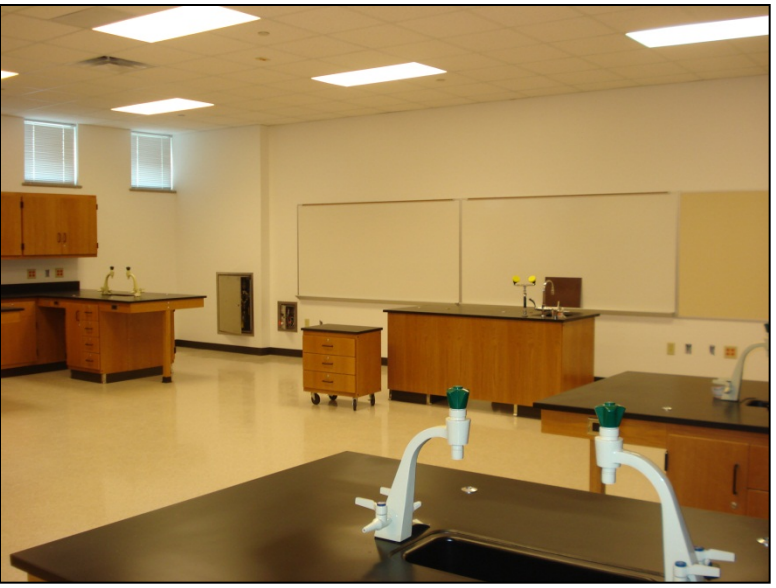
View of new Science Lab