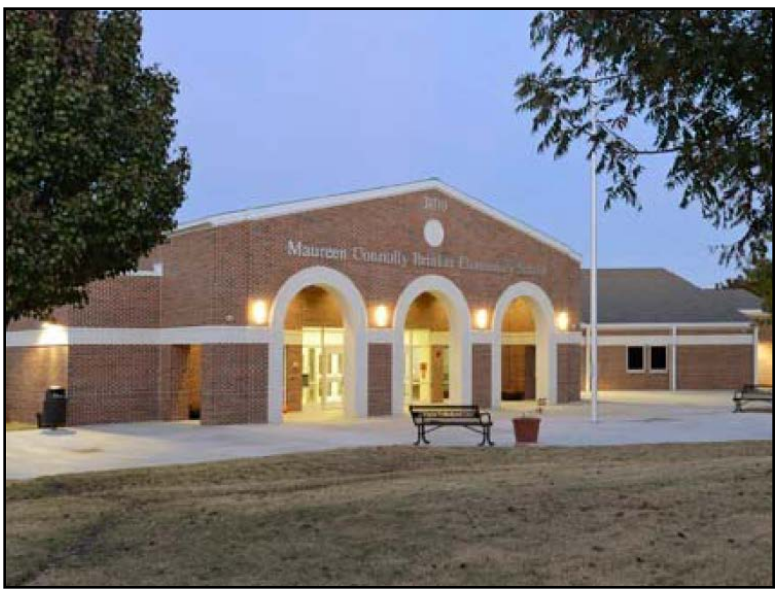
View of new Main Entry