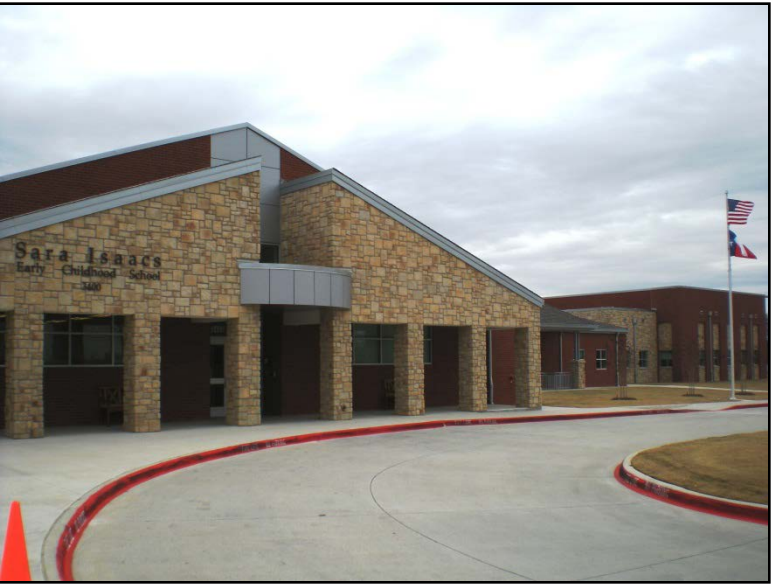
View of new Main Entry