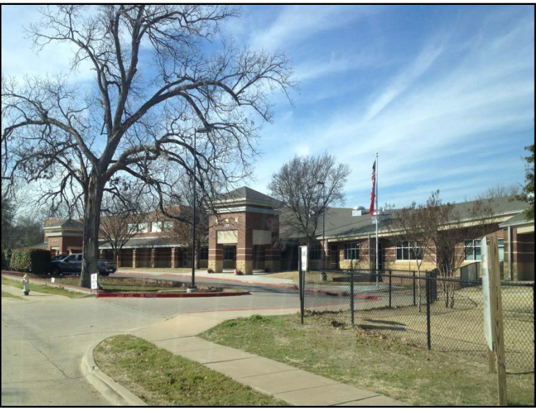
View of new Main Entry