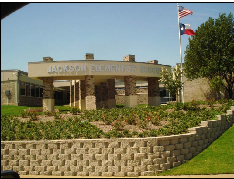
View of new Main Entry