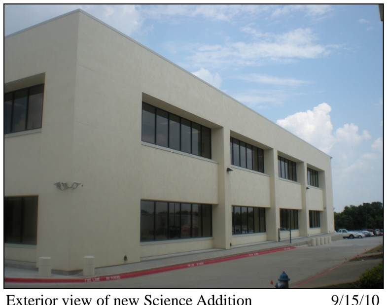
Exterior view of new Science Addition