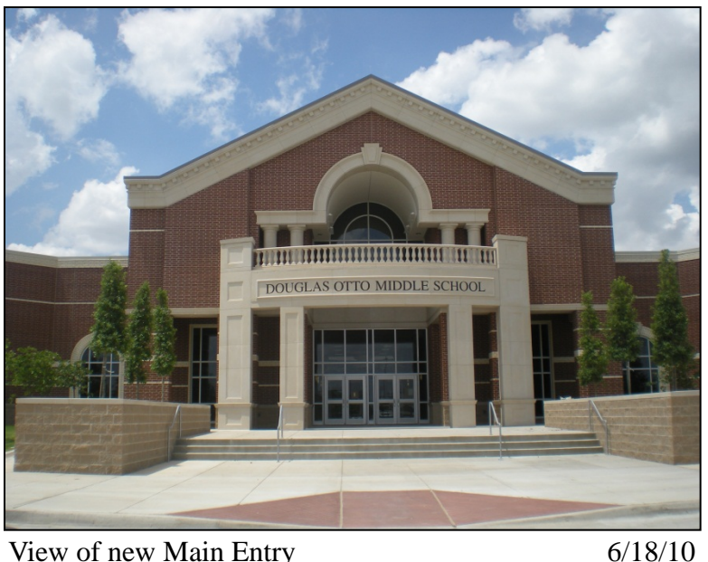
View of new Main Entry